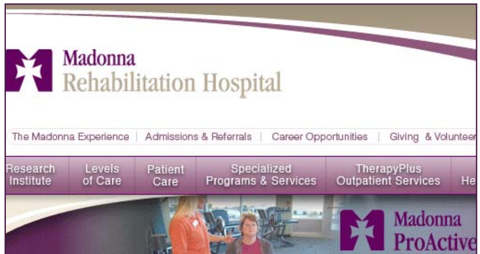
Madonna's newly revamped Web site supplies answers at your fingertips.

Detailed information about Madonna's accredited rehabilitation programs is quickly accessible and