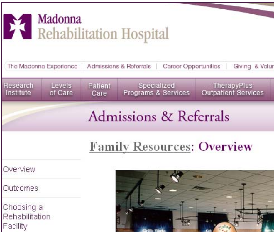
The Admissions & Referrals section of Madonna's new Web site offers a wealth of information to case managers, patients and their families.